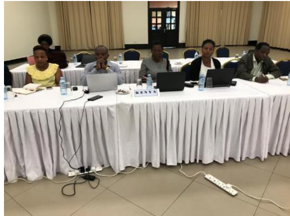
The delegation from Kenya