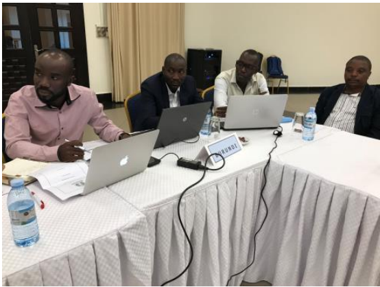
The Burundi delegation