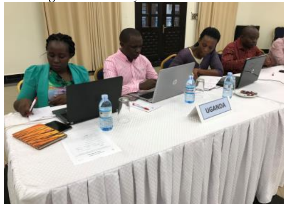
The delegation from the host country, Uganda