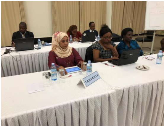
The delegation from Tanzania