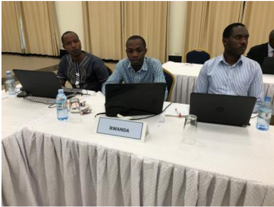
The Rwanda delegation at the regional meeting